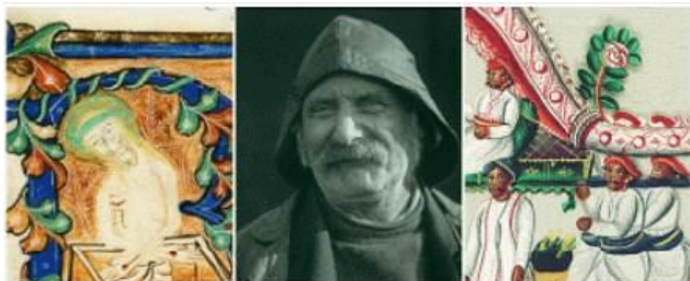
Welcome to LANCAT

The complete series, 1852-1974, comprises around 15,000 plans and is part of the Preston County Borough Council archive (CBP). It is now far more accessible thanks to the efforts of our volunteers who, over the last couple of years, have produced a complete and detailed listing which is available to search in Lancat our online catalogue.